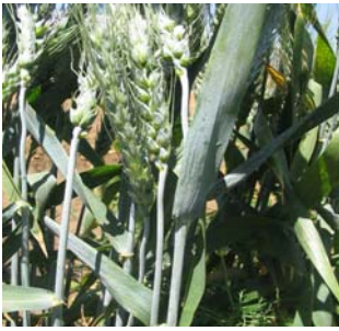
Figure 1. Wax in Patwin

Patwin (experimental line UC1419) is a Hard White Spring derived from the cross Madsen/2*Express .